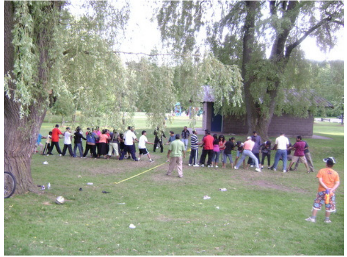
Figure: Tug of war between Fathers-daughters vs. Mothers-sons